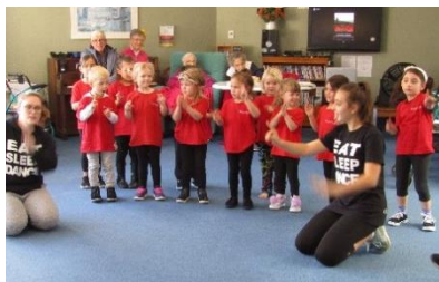
Groov-it Waiuku Mini Peeps