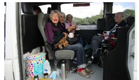
Awhitu Regional Park