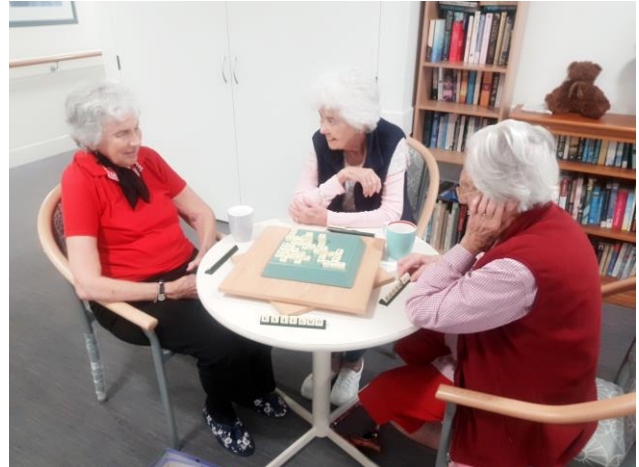
Residents enjoying a game of scrabble