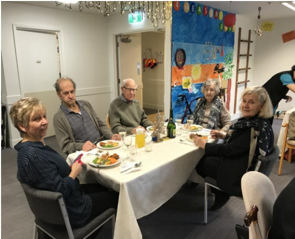
Mid Winter Lunch with our Residents and Whanau

Address: 105 Botany Road, Howick 2010 Phone: (09) 535 4244 Fax: (09) 537 1311 Email: lansdowne@cht.co.nz