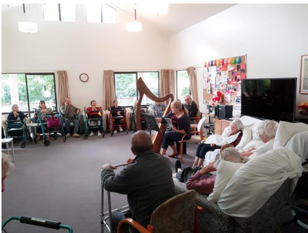
Music therapy with the Residents