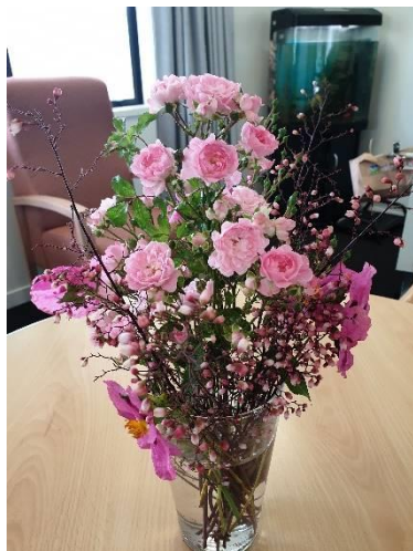
Flowers arranged by residents

Address: 20 Lincoln Road, Henderson 0610 Phone: (09) 838 8348 Fax: (09) 836 7223 Email: carnarvon@cht.co.nz